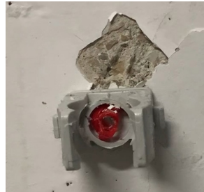
Without pre-nailing drill bit